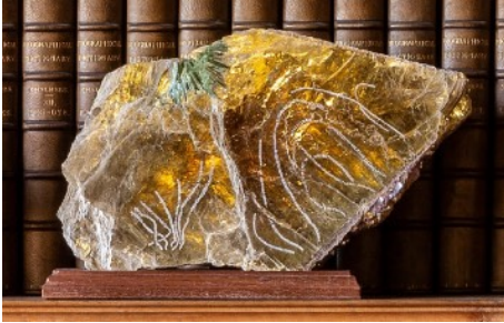
Ilana Halperin The Library #1, 2020 Etched book of 400 million year old Mica, Tourmaline, Lepidolite, Maine 28 x 17 cm 11 x 6 3/4 in

£2,800 / $3,200 (or Art Money $320 monthly)