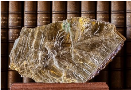
Ilana Halperin The Library #2, 2020 Etched book of 400 million year old Mica, Tourmaline, Lepidolite, Maine 16.5 x 26.5 cm 6 1/2 x 10 1/2 in

£7,000 / $8,000 (or Art Money $800 monthly)