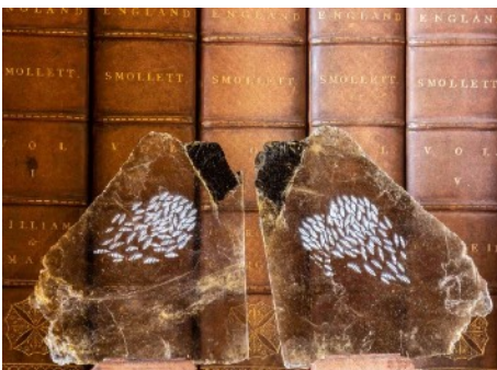
Ilana Halperin The Library #16 & 17 (pair), 2020 Etched book of 800 million year old Mica and Biotite, Inverness-shire 9 x 10 cm (each) 3 1/2 x 4 in (each)

£5,500 / $6,300 (or Art Money $630 monthly)