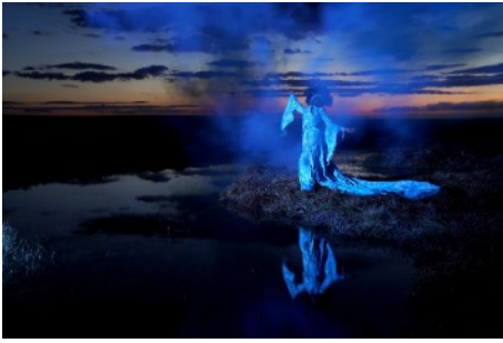
Sekai Machache Deep Divine Sky 3, 2021 Photographic print on aluminium 125 x 84 cm 49 1/4 x 33 in Edition of 10 + 2 AP

£2,800 / $3,200 (or Art Money $320 monthly)