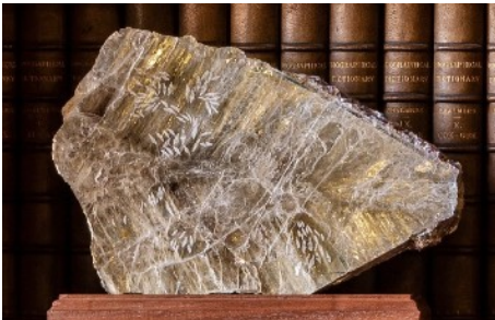
Ilana Halperin The Library #11, 2020 Etched book of 400 million year old Mica with single Tourmaline, and smaller Lepidolites, Maine 17.5 x 26.5 cm 7 x 10 1/2 in

£5,500 / $6,300 (or Art Money $630 monthly)